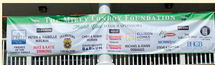
Sponsors from the 1 st Mikey Conroy Memorial Foundation tournament which raised $20,000 for First Tee - Connecticut!