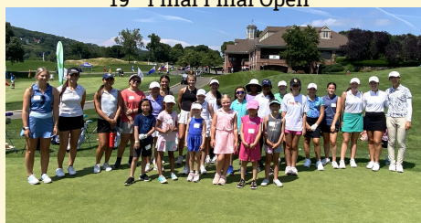
First Tee - Connecticut Girls Clinic with the LPGA Epson Tour Pros at the Hartford HealthCare Women's Championship