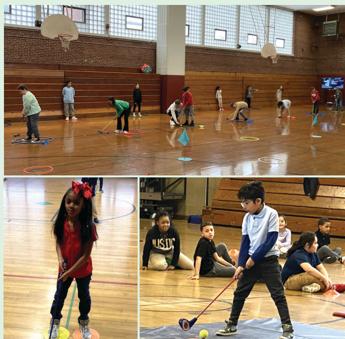
(Top) In-School Program at Derynoski School, Southington. (Bottom) Kids playing with SNAG equipment in our Waterbury Schools.