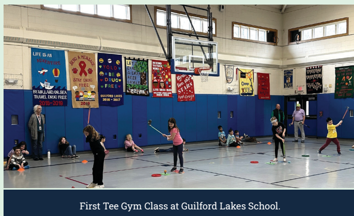
First Tee Gym Class at Guilford Lakes School.

For almost 15 years, First Tee – Connecticut has been delivering golf-based life lessons to Bridgeport students, primarily through our "In-School Program," a weeklong immersion for K-5 students.