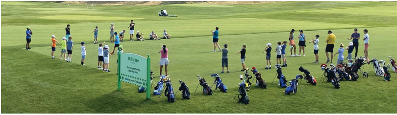
Summer Camp participants start the morning with stretching exercises led by staff from Hartford Healthcare's Bone & Joint Institute.